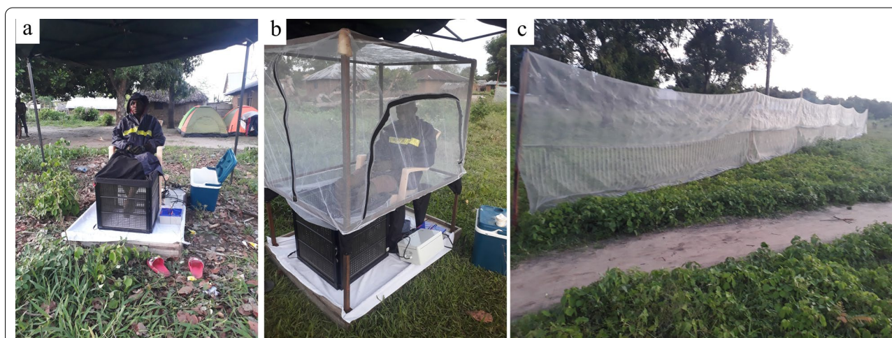
Fig. 1 Photographs of the three traps used in the present study. a The early mosquito electrocuting trap (METe), b the modified mosquito electrocuting trap (METc), c the barrier screen trap (BST)

The BST (Fig. 1c) targets both host-seeking and blood-fed mosquitoes. It works by passively intercepting mosquitoes (without the use of adhesive) on their way to either host-seeking, resting or oviposition sites [12]. We used a BST measuring 30 m long and 2 m in height made of whitish polyethylene wire mesh materials. During the end of 15 min of each collection hour, each side of the