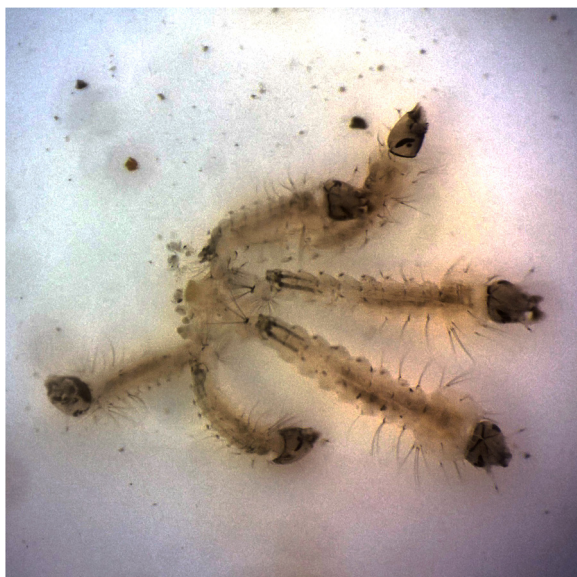
Fig. 2 Clustering of dead Anopheles quadriannulatus larvae 24 h after being fed a powdered black pepper treatment mixture. Similar clustering was observed among all strains of all An. gambiae complex species tested

Other than the mortality of FANG exposed to the 100 % dose, which was less than in the 40 and 80 % doses, mortalities among An. funestus larvae generally increased with increasing proportions of black pepper.