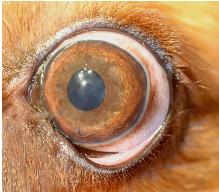
Fig. 2 Case 2. Angiostrongylus vasorum in the anterior chamber of the left eye of a dog

cuticle. However, the nematode was damaged and further morphological features were not evaluated, with the exception of the uteri, which lacked first-stage larvae, and the vulva. Therefore, the dog was subjected to coprological examination for the detection of L1 using the Baermann technique. The 18S rDNA sequences obtained from both L1 collected from the faeces and the female nematode displayed 100 % identity to the nucleotide sequence of A. vasorum [GenBank: AJ920365]. The dog lacked any signs of respiratory infection, both previously and during the observation period. The animal was treated with fenbendazol 25 mg/Kg per os SID for 3 weeks associated with prednisolone 0.2 mg/Kg.