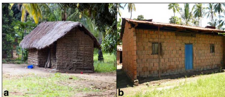
Figure 2 Representative house types commonly available in Idete and Namwawala villages. A temporary house (a) and a permanent house (b).

The analysis was performed using generalized linear models (GLM) (MATLAB R2012a, Poisson distribution, 95% confidence interval) to assess the impact of each